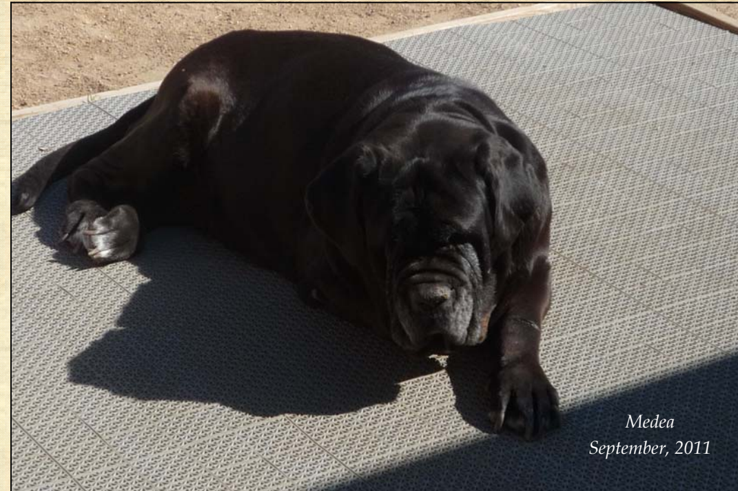
Medea September, 2011