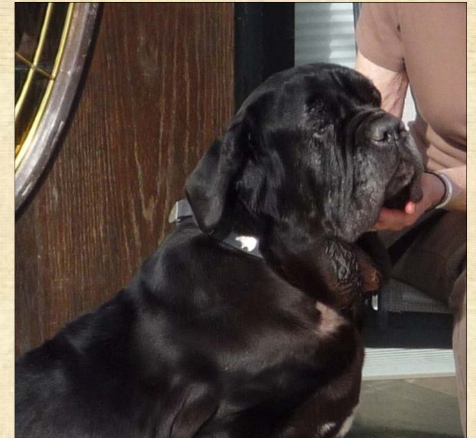
Medea and Mom 2/12/10