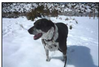
"Shamu", what a love!