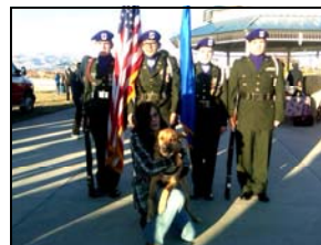
"Hunter" with the National Guard Color Guard 3/14/10

visit ended, "Hunter" continued to look for Lt. Shaw under the computer table!!!