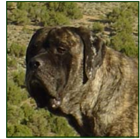
Our beloved "Honey Bear" 1999—2007